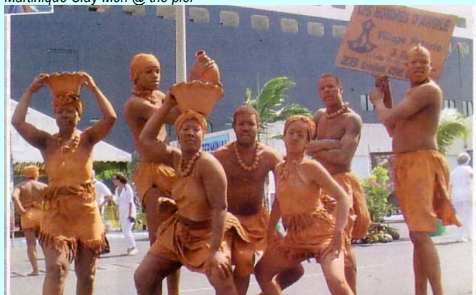
Martinique Clay Men @ the pier